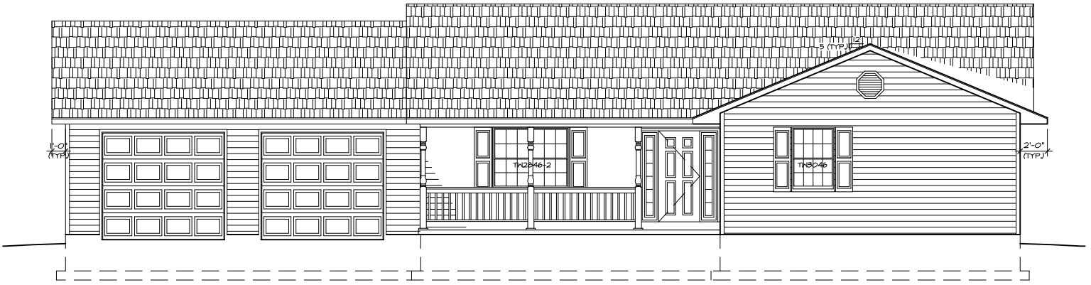
1 FRONT ELEVATION A-1 SCALE: 1/4"=1'-0"